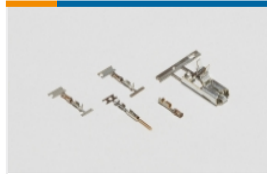
Wire-to-Board Connector Contacts(6)